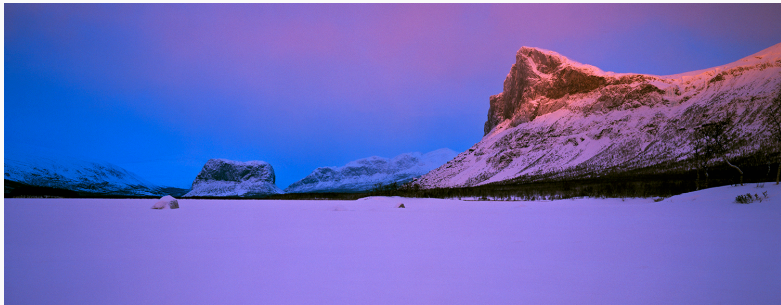
Mount Skierfe in Winter