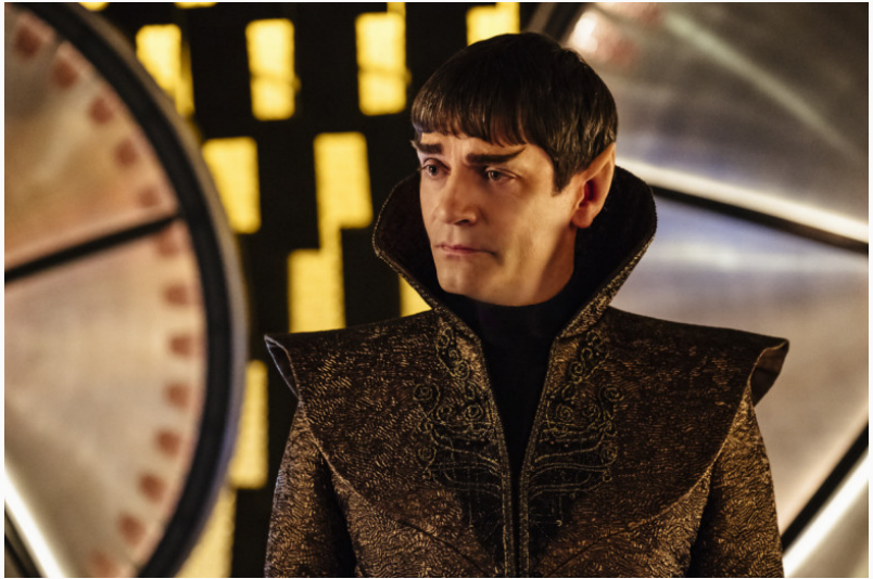
James Frain as Sarek, "Star Trek: Discovery"