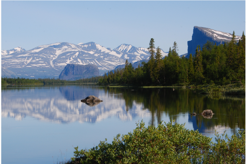
Mount Skierfe in the Sarek National Park in Summer